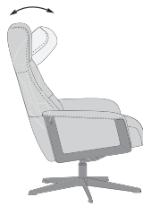
FRICTION BASED HEAD-AND-NECK SUPPORT