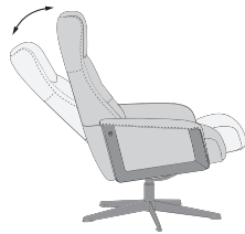
EFFORTLESS RECLINING MECHANISM