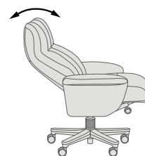
Manual angle adjustable headrest