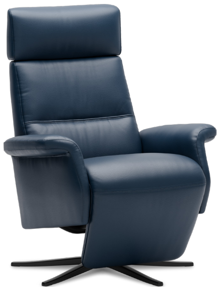
Space Manual Integrated 3600