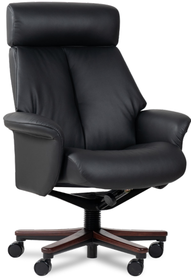
Nordic Office 85 W77 x D77 x H105-117/112-124 (M)