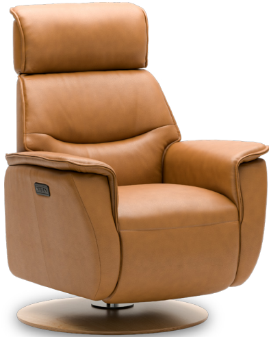
Monterey W87 x D92 x H112 cm (M)