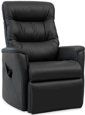
Liberty LF W87 x D92 x H105-143 (L)