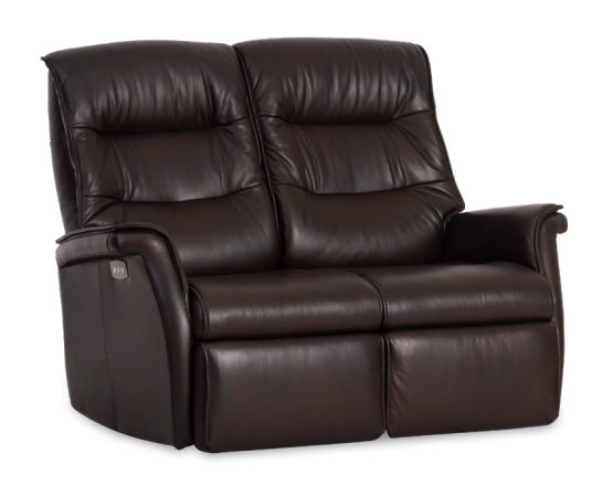
Chelsea Power W143 x D93-94 x H101 (2s)