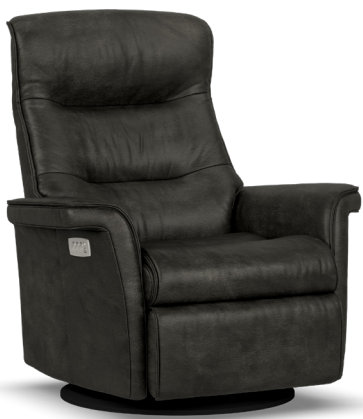
Chelsea Relaxer Power W84 x D86 x H105 (M)