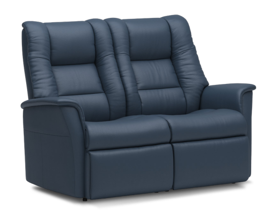
Brando Manual W145 x D96 x H104 (2s)