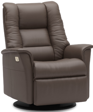
Brando Relaxer Power W80 x D91 x H102 (M)